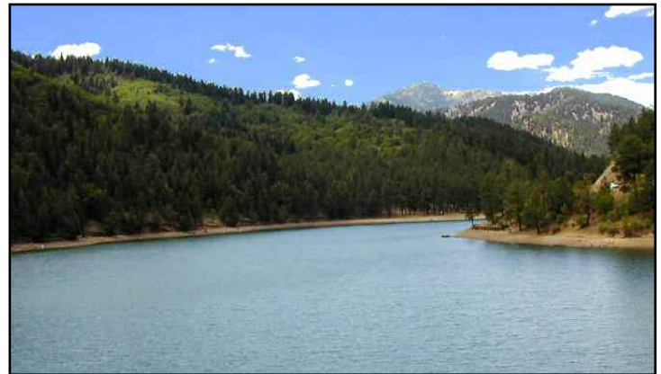
The resort town of Ruidoso with all its winter and summer activities is just 70 miles west of Roswell on Highway 70.

Less than two hours northwest of the Buck Passer Ranch you will find Albuquerque and Santa Fe, two of the economic and cultural meccas in all the Southwest. Albuquerque and its 700,000 residents offer all you could want in shopping and entertainment, while Santa Fe draws visitors worldwide to its world-class art galleries.