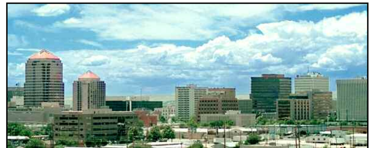
Albuquerque is only a couple of hours away from the ranch.